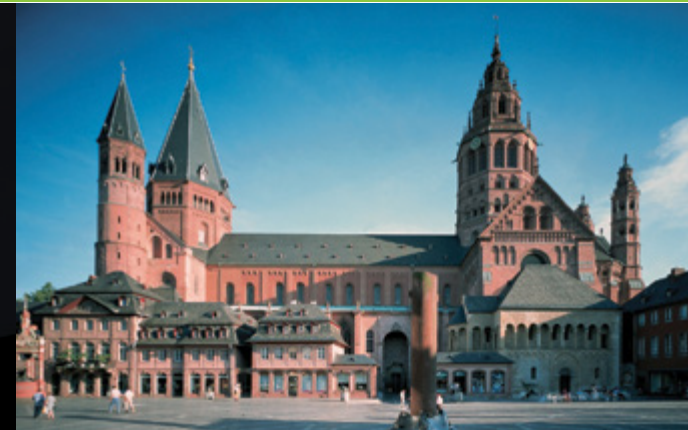
The Market Square in Mainz offers a beautiful view of the Dom.

Located on the Rhine River with a covered corridor connection to the Congress Centrum Mainz, this 4-star hotel offers ideal lodgings for our conference attendees. Only a short walk to Old Town with its famous Dom, elegant shops and restaurants, the Hilton facilities include: